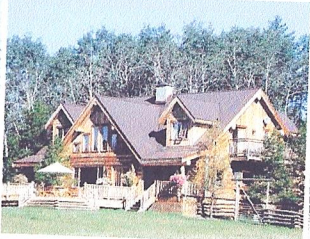
Siwash Lake ranch (inset bottom), a fine base from which to explore Cariboo Country on horseback